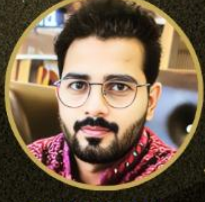
RISHU VAISH RRB PO & RRB CLERK