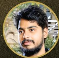
BH VINAYAKA (IBPS RRB PO 2024)